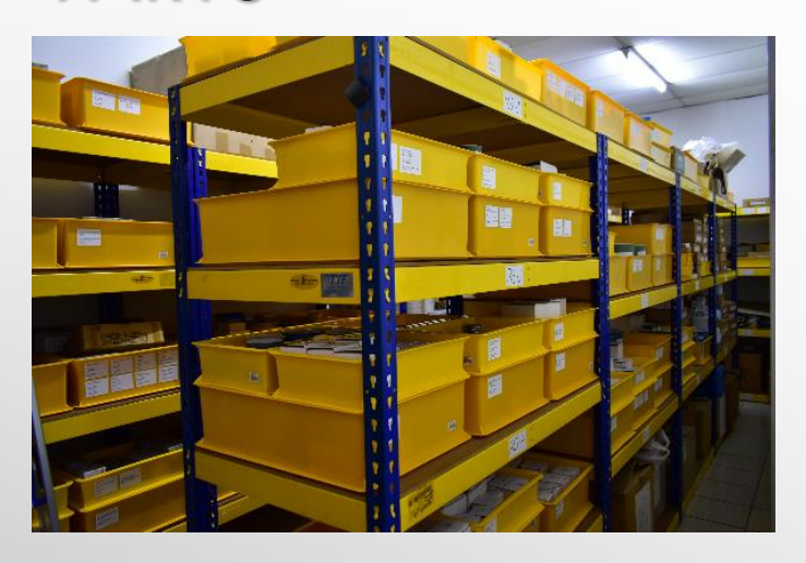
Variety of Mechanical seals stocked